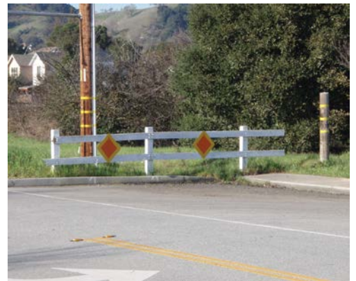
City Street Barricades